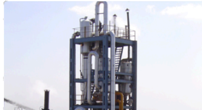
DIRECT CONTACT JUICE HEATER