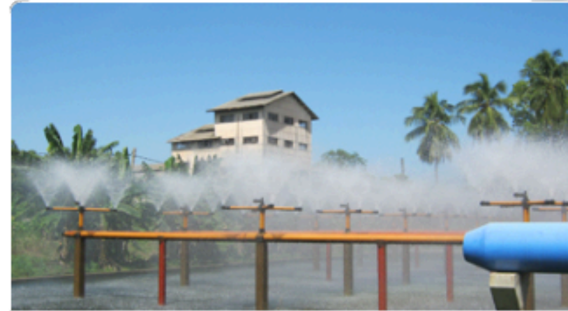
COOLING & CONDENSING SYSTEM