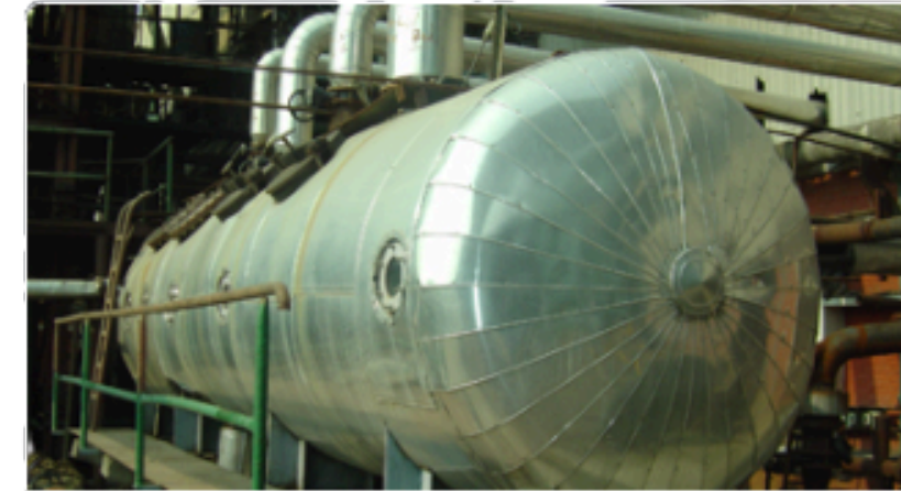
CONDENSATE FLASHING SYSTEM