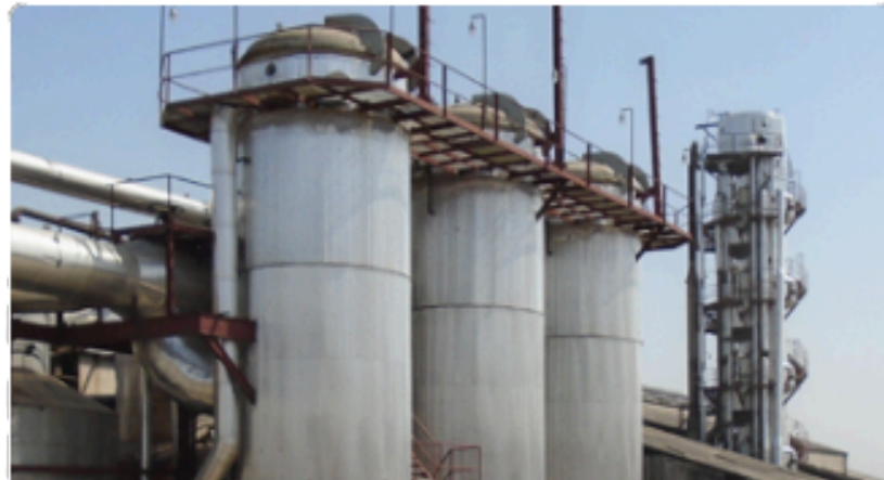
TUBULAR FALLING FILM EVAPORATOR