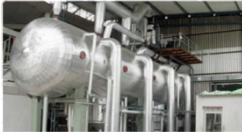
LOW TEMPERATURE EVAPORATOR