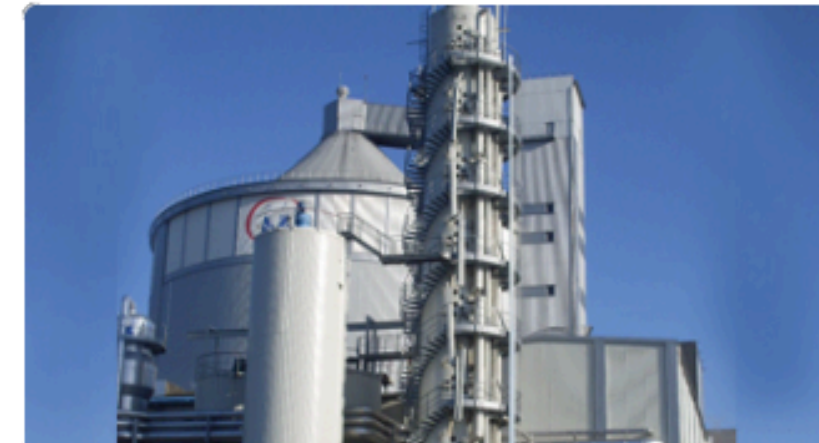
SPRAY CONTINUOUS PAN (SCP®)